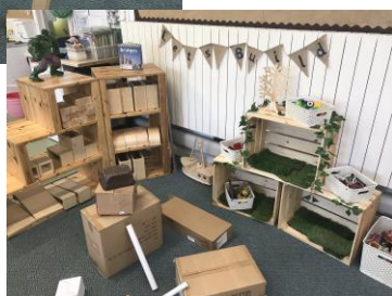
Learning through play