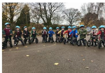
Gross-motor skills and physical development