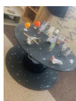
Responding to pupil interests