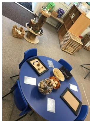
Adults as facilitators